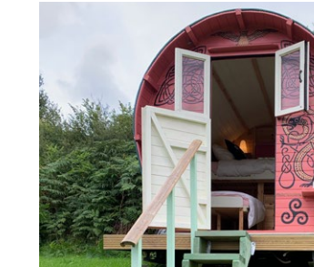
Celtic Dragon Gypsy Caravan ▶