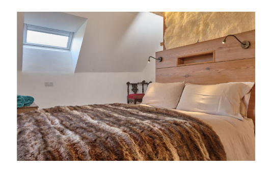
Owl Nest ▶