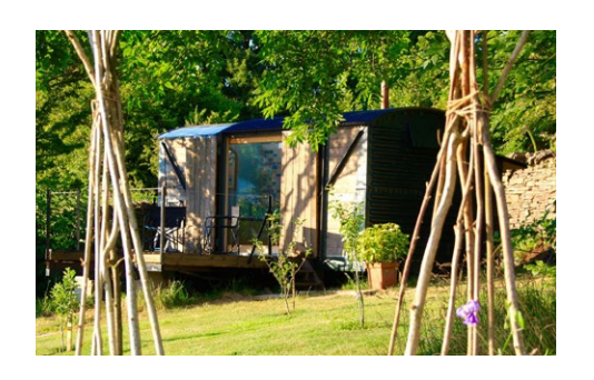
Railway Carriage ▶