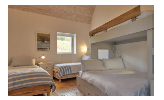
Bunk House ▶