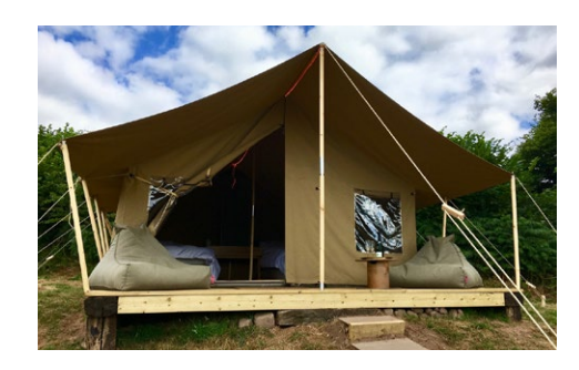
Luxury Safari Tent ▶