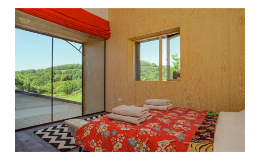
Twin Peaks ▶