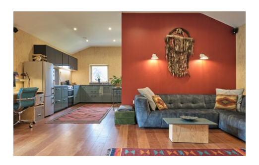
Fforest Cabin ▶