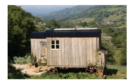
Shepherd Hut ▶